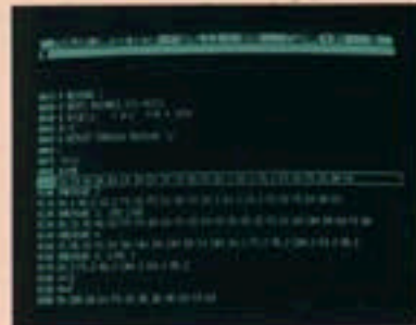
Notes may be entered in from the Music Keyboard directly and timing information can be added later using the Editor Controls on the Alpha-numeric keyboard. Line numbering (left hand column) is provided automatically.

An ! sets a new default (normalizing) condition which might refer to a new tempo setting, octave select or key velocity.