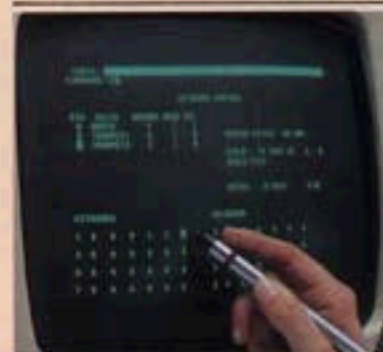
KEYBOARD CONTROL: Provides allocation of Voices to various Registers in the keyboard or sequencer. In this example ANDY8 is able to play 4 note polyphonically in register A which is on all keyboards except for keyboard 1, where the top 3 octaves are playing "TRUMPET2" (Register C) and the bottom 3 octaves are playing "TRUMPET1" (Register B). Selection of keyboard registers is done with the light-pen. The top right hand page allows pitch adjustment and scale changing.

The pitch of any note played on the keyboard is normally calculated according to a formula defining a conventional 12-note equally tempered scale, however, virtually any scale can be specified. To completely change the keyboard tuning to a new scale takes only a few seconds.