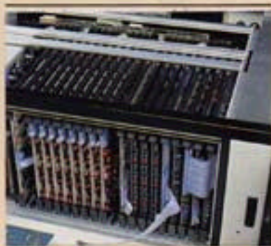
Modular construction allows field replacement of virtually all modules. Extensive use of MOS and Low Power Schottky technology keeps heat dissipation to less than 500 watts.

The Fairlight comes with 80 kilobytes of Random Access Memory (R.A.M.) in the processor section and 16 kilobytes in each of the eight voice modules making a total of 208 kilobytes. Four extra module slots are available for expansion and special interfaces. The two disc drives provide One Megabyte of on-line disc storage.