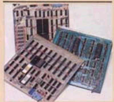
Up to 20 circuits modules can be accommodated in the Fairlight. Shown here are the "Graphics controller" (front), "Voice module" (rear left) and the "Dual Processor Module". Key modules plug into the Fairlight from the front.

As well as a powerful dual central processing unit, the Fairlight has specialized hardware for directly generating sounds. Each of these "Voice Modules" contains large amounts of sound waveform memory which can be controlled to provide pitch and level variations of the waveforms generated. The Timbre of the sound is determined by the harmonic content of the waveforms.