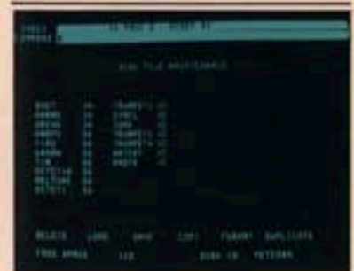
DISK FILE MAINTENANCE: Displays the names of "files" which are available for loading from the user's disc. Files may describe Voices (the sounds themselves), Sequences, and Instruments (combinations of sounds with control details). Other special files such as composition sequences can be accessed via this page, operating the light-pen enables loading of sounds from the disc in several seconds.

All information is displayed in a logically organized series of graphics display "pages". Using the light-pen, the musician simply points at the parameter he wants to change and enters the new data — either by using a typewriter style alpha-numeric keyboard or drawing curves directly onto the screen.